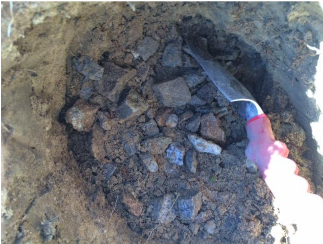
Observation hole #2