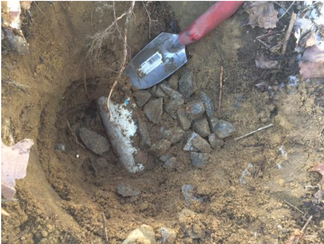
Observation hole #1