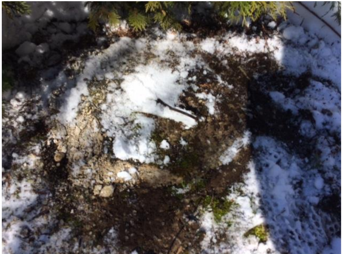
Tank riser cover