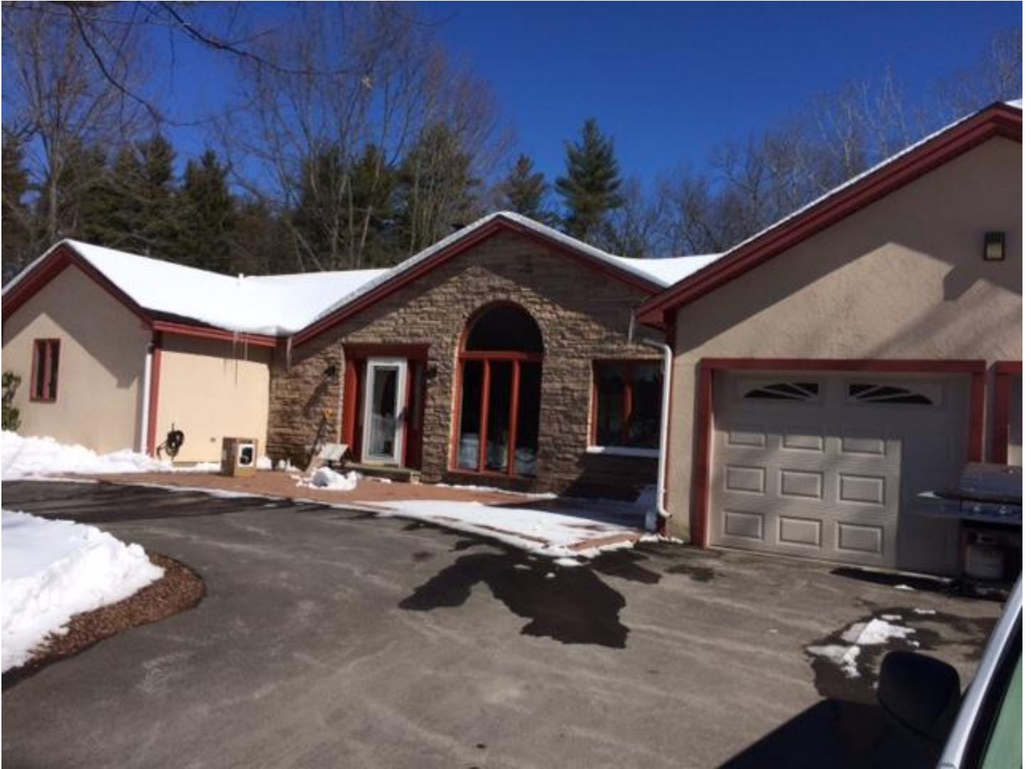
71 Water Rd. Drain, NH